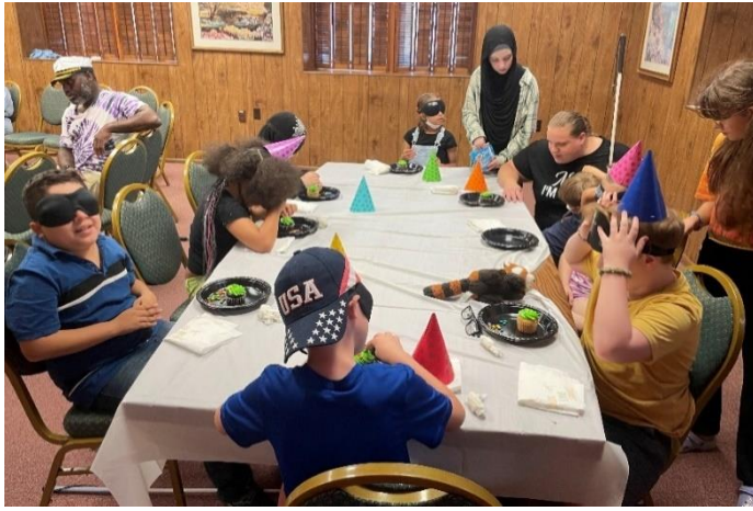
Image: NFB BELL Academy students in Baltimore celebrate Louis Braille's birthday