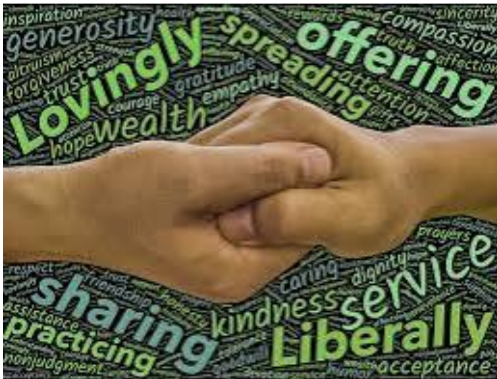
Image description: Two hands grasping the fingers of one another, surrounded by a word collage including the words: generosity, lovingly, trust, spreading, offering, compassion, sharing, practicing, kindness, dignity, service, acceptance, and nonjudgement.

Friday, February 16 to Sunday, February 18