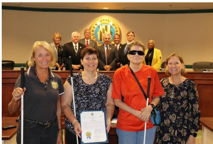
Image: NFBMD members receive White Cane Day proclamation at Worcester County Board Meeting