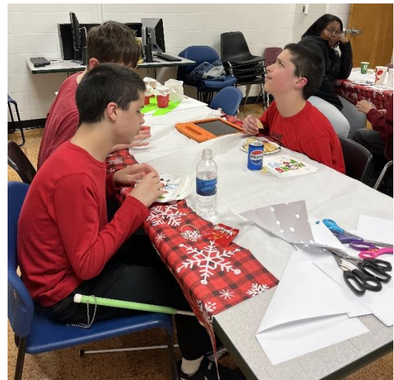
Image: NFB BELLX Academy students in Salisbury attend a holiday party.