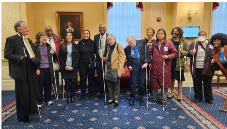
Image: NFBMD members stand with sponsor Senator Benjamin Brooks at Senate Accessible Electronic Ballot Return Voting bill hearing