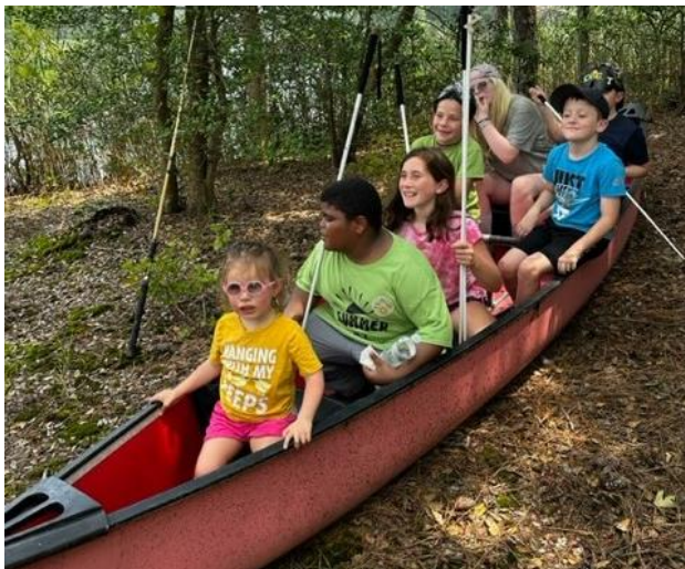
Image: NFB BELL Academy students in Southern Maryland sit in a canoe