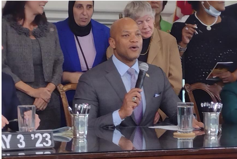
Image: Governor Moore signs Accessible Prescription Label bill into law surrounded by NFBMD members