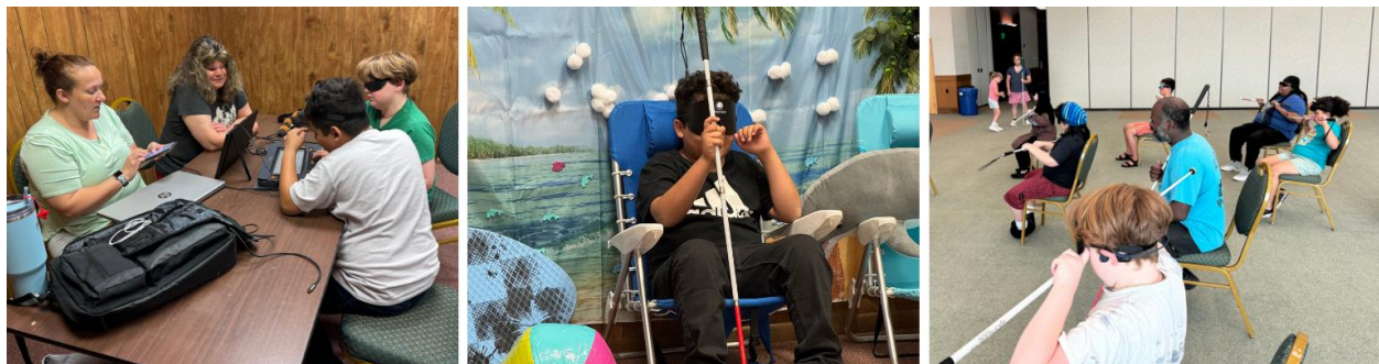
Baltimore Images: Two teachers teach NFB BELL students chess on Monarch (left). At BELL beach, blind student sits on beach chair in front of beach backdrop surrounded by beach ball and surf board (center). Kids and staff wearing learning shades do a cane workout while seated on chairs (right).