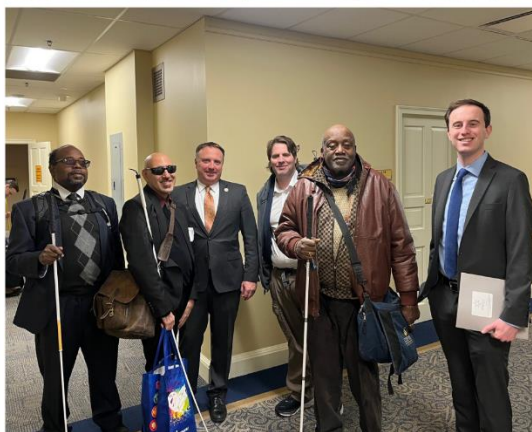
Image: NFBMD members smiling with different MD House of Delegates and Staff at Day in Annapolis