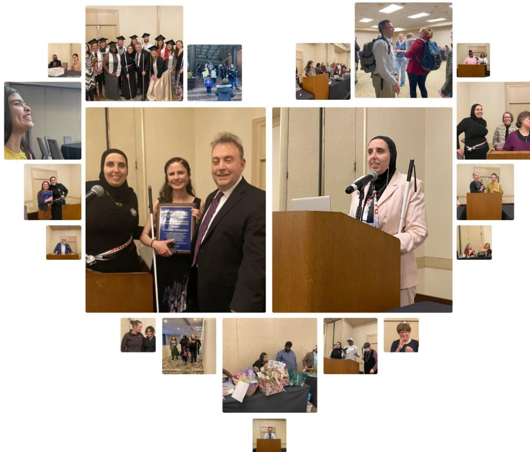
Image description: Twenty photos from state convention are laid out in various sizes to form a heart — various NFBMD members and leaders smile and laugh together, present at podium, receive awards, manage door prize table, and participate in cane walk.

Thursday, February 13 to Sunday, February 16