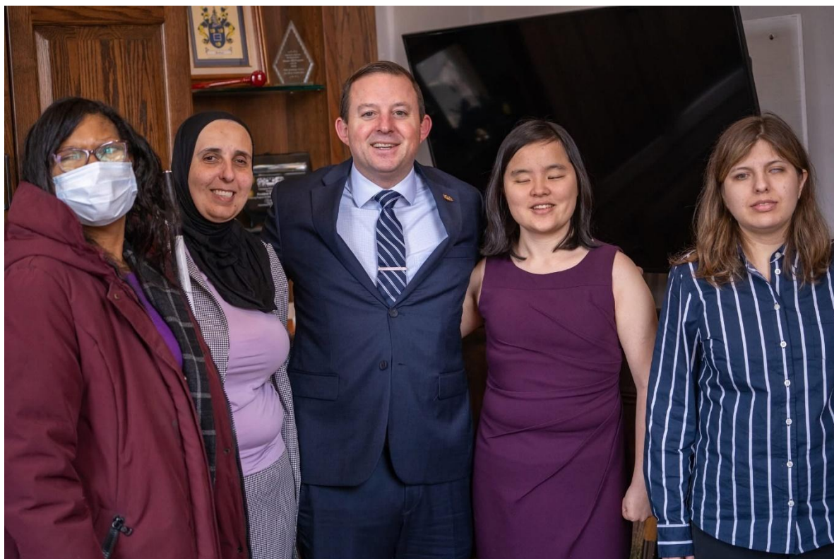
Images above and below: NFBMD members with Maryland representatives