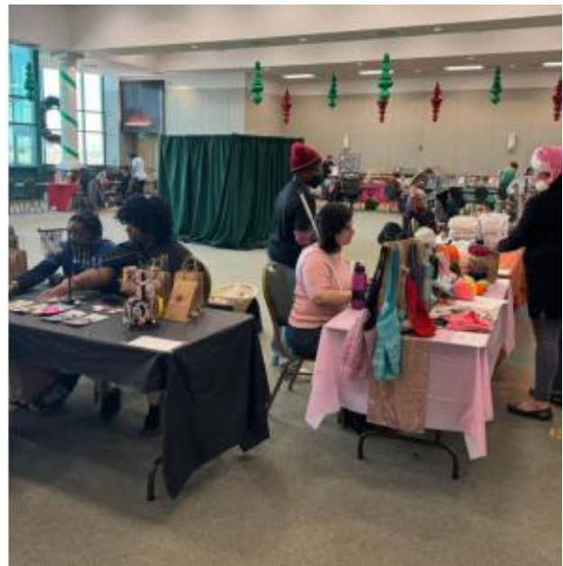
Image: NFB Winter Market tables with members displaying crafts, clothing, and homemade gifts.