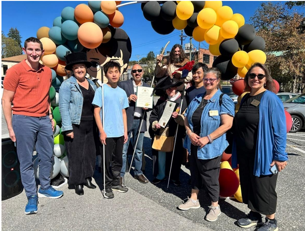
Image: NFBMD members host Wizarding Weekend on Magical Main in Old Ellicott City to commemorate Blind Equality Achievement Month and White Cane Awareness Day.