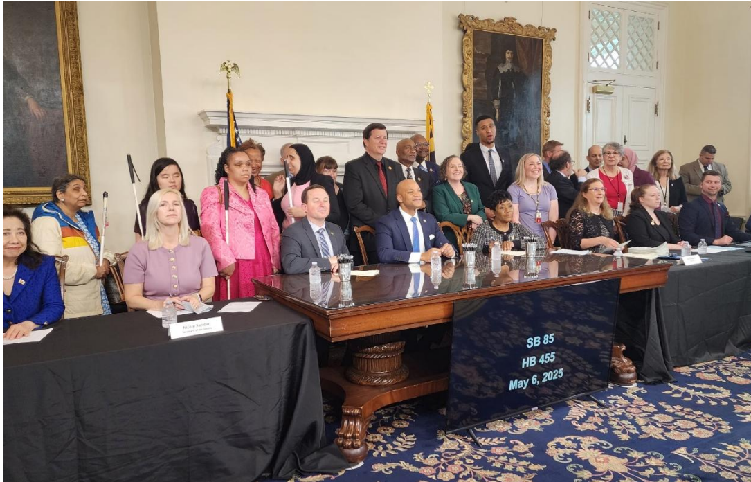
Image: Governor's bill signing in May 2025 SB84/HB455 Braille Flag Memorial Act of 2025 with Governor Moore, Sponsors, and NFBMD members