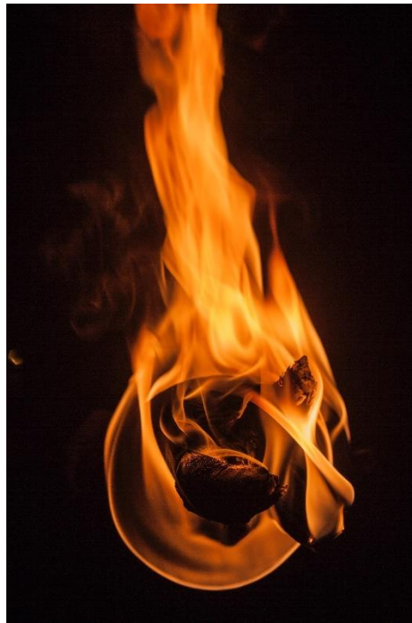
Image description: An up-close, head-on photo of a lit match with a tall orange flame.

Friday, November 11 to Sunday, November 13