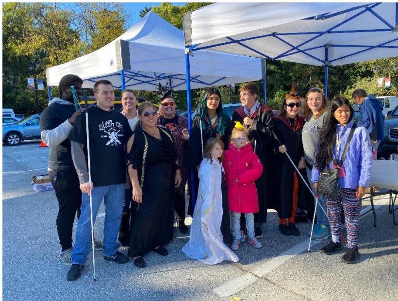
Image: Group photo of the Wizardsing Weekend volunteers — some are wearing wizard outfits and some are holding long white canes